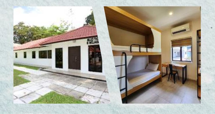
Yacht Club Chalet (5 bedrooms, 322sqm)

Yacht Club Bungalows (2 bedrooms, 191sqm)