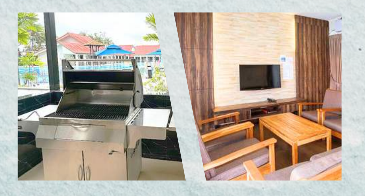
Sea View Terraces (4 bedrooms, 360sqm)